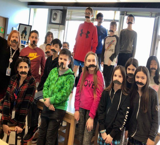
Howard B. Mattlin Middle School Music Rehearsal Schedule 2019-2020